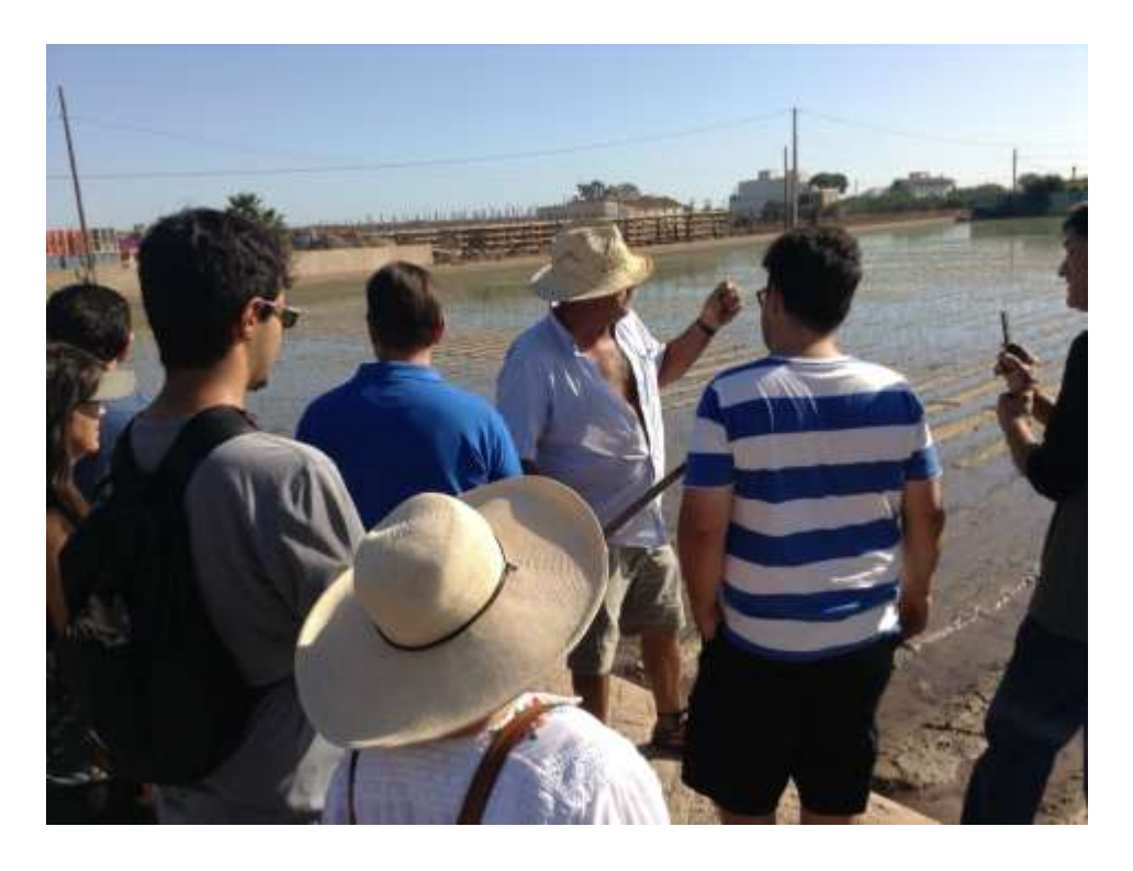
Field tour of huertas irrigated by Acequia Rascayna and hosted by regante in charge.