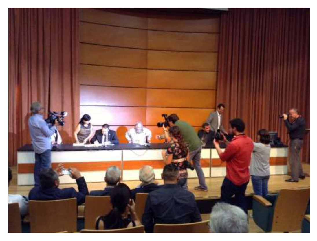
Conclusion of the Hermanamiento ceremony with signing of the Declaration by acequia officers from Valencia and New Mexico.