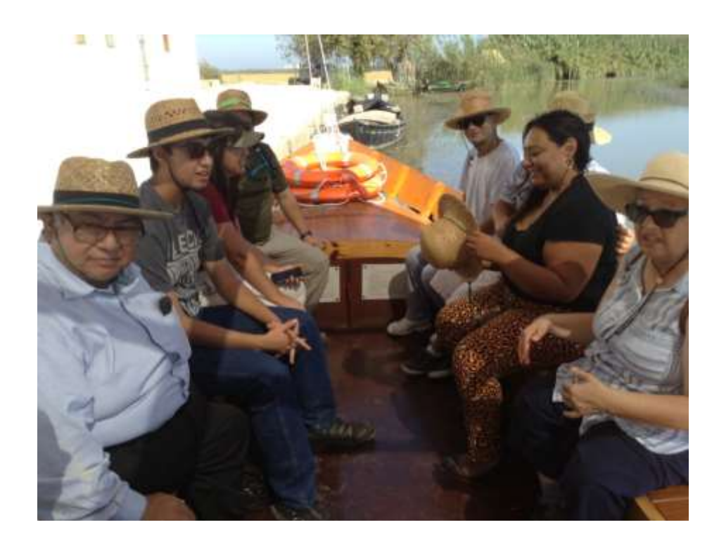
Boat ride by NMAA delegates on way to rice farms at Albufera Park.