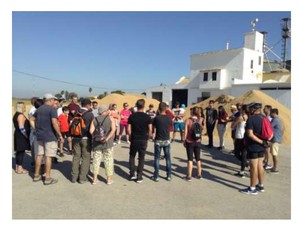
Rice plant with piles of rice ready for processing at a family owned enterprise on the Albufera.