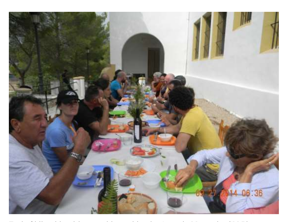
End of bike ride with a meal hosted by the Acequia Moncada.