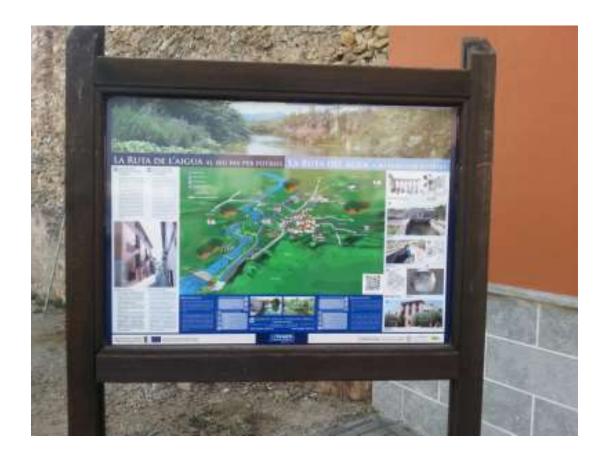
Field tour of La Ruta del Agua (The Water Route) at Potries, a municipality a short train ride from Valencia in the region of La Safor near Gandia and Oliva.