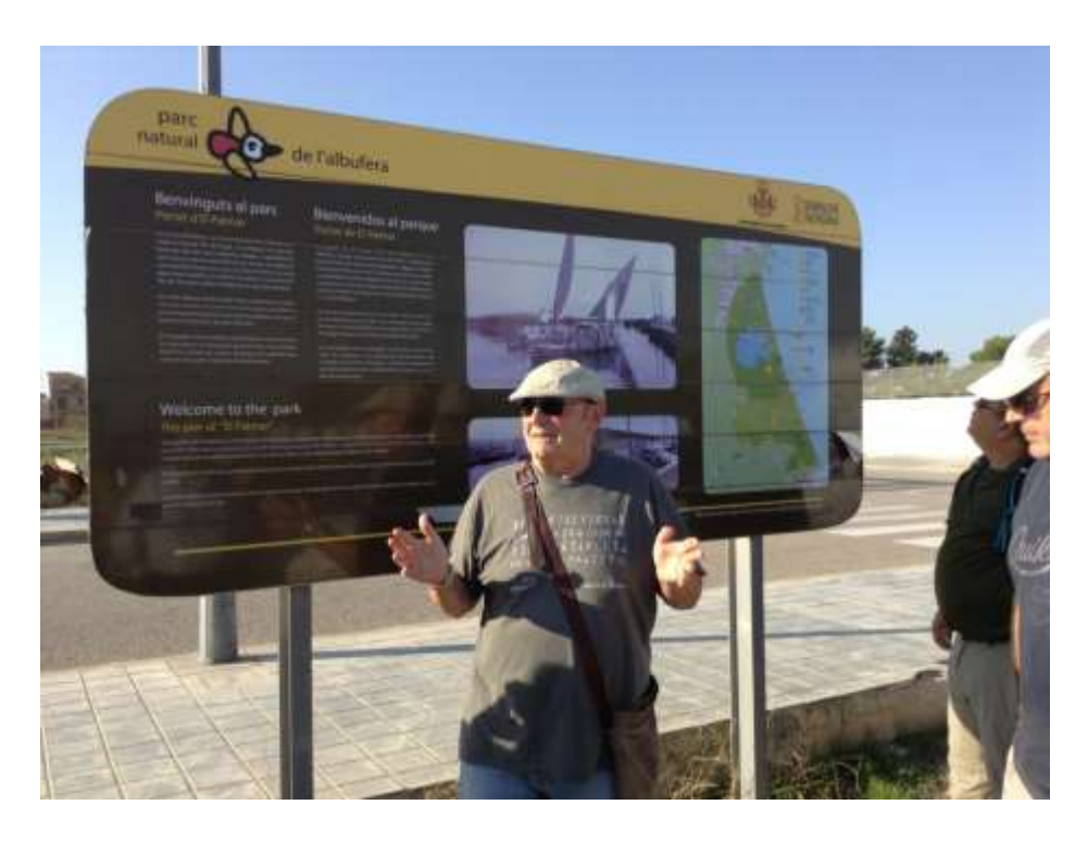
Field tour of the Albufera Natural Park and rice farms.