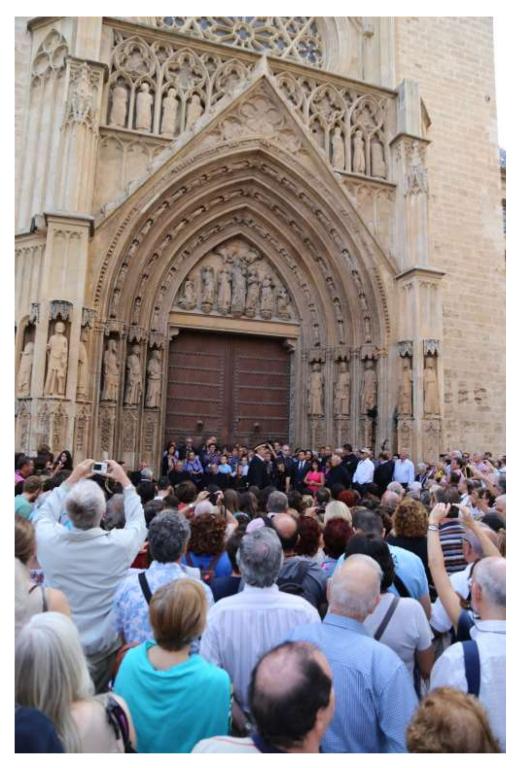
September 2014 First Visit : Water Court in session with New Mexico delegation as special guests situated in the perimeter of the Cathedral portico.