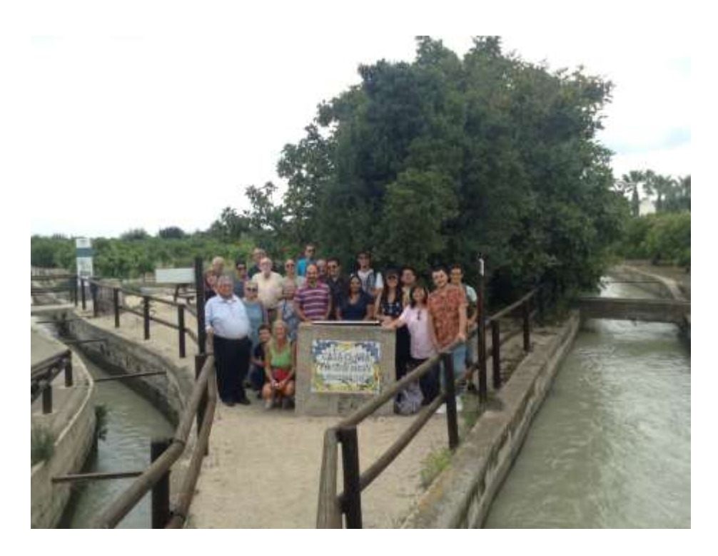
NMAA delegation at Casa Clara Partidor at Potries taking water to Séquia Comuna Gandia and Séquia Comuna Oliva.