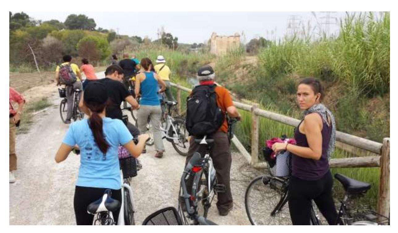
Bike ride tour along a Valencia acequia.