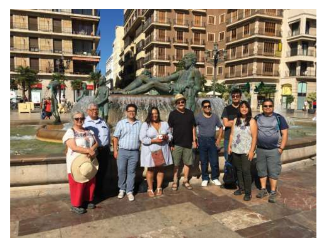
NMAA delegation at the Río Turia fountain of acequias.