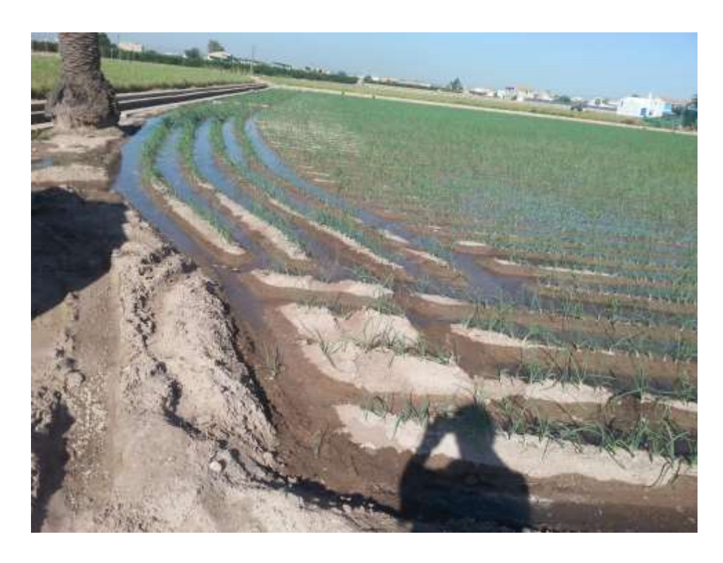
Irrigation underway during field tour of Acequia Rascanya.