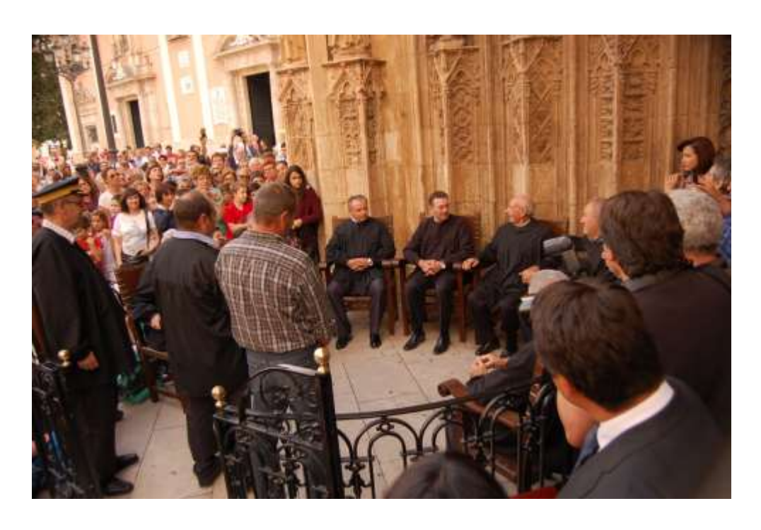
Water Court Síndicos deliberating a case of rule violations by an acequia irrigator standing in front of them.