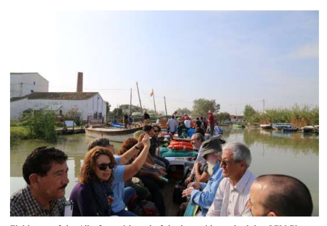
Field tour of the Albufera with end of the boat ride at the lake.